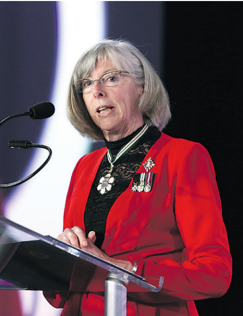
The Honourable Judith Guichon, Lieutenant Governor of British Columbia