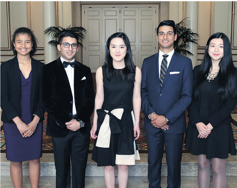
Student speakers at the 11th Annual BLBC Hall of Fame Gala Dinner and Induction Ceremonies