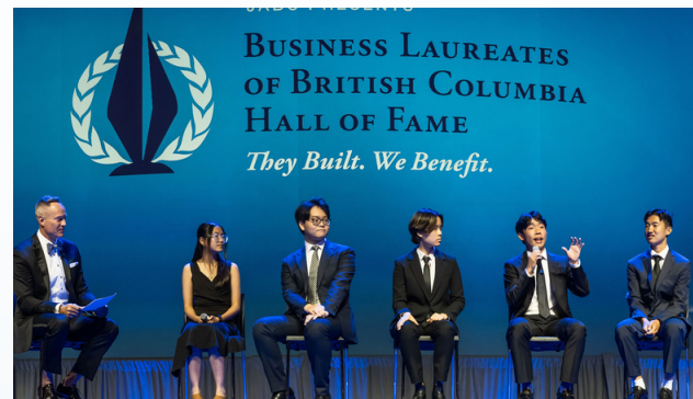
Recipients of the JABC Junior Entrepreneur Award