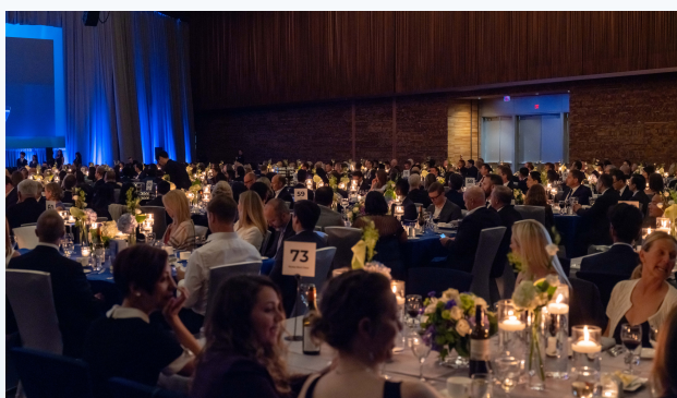
Vancouver Convention Centre West Ballroom